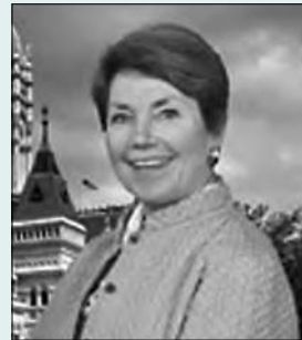
Rep. Livy Floren