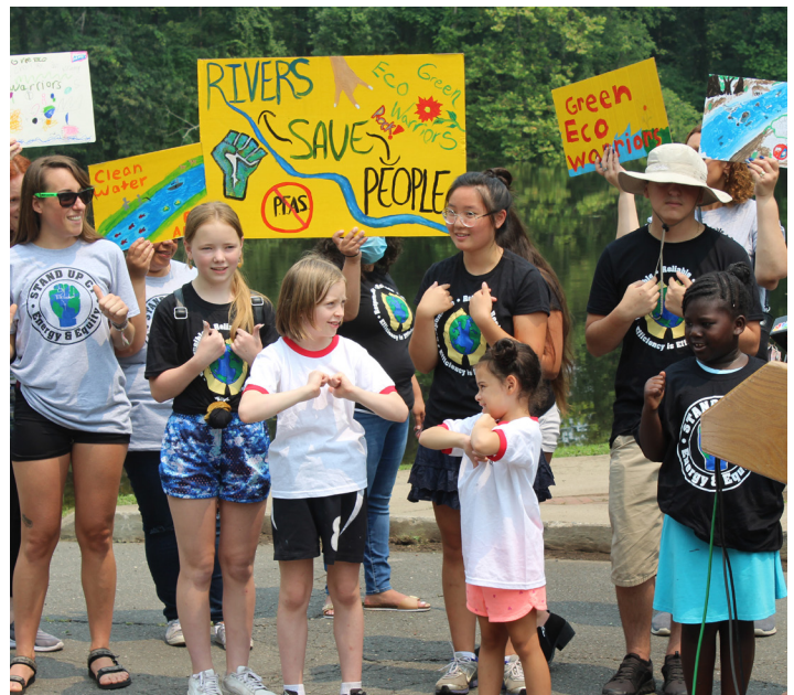
The Eco Green Warriors show their support for the PFAS bill at the PFAS bill signing and press conference.