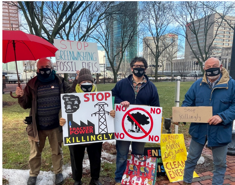
Advocates gather for the 2022 Climate Justice march in Hartford