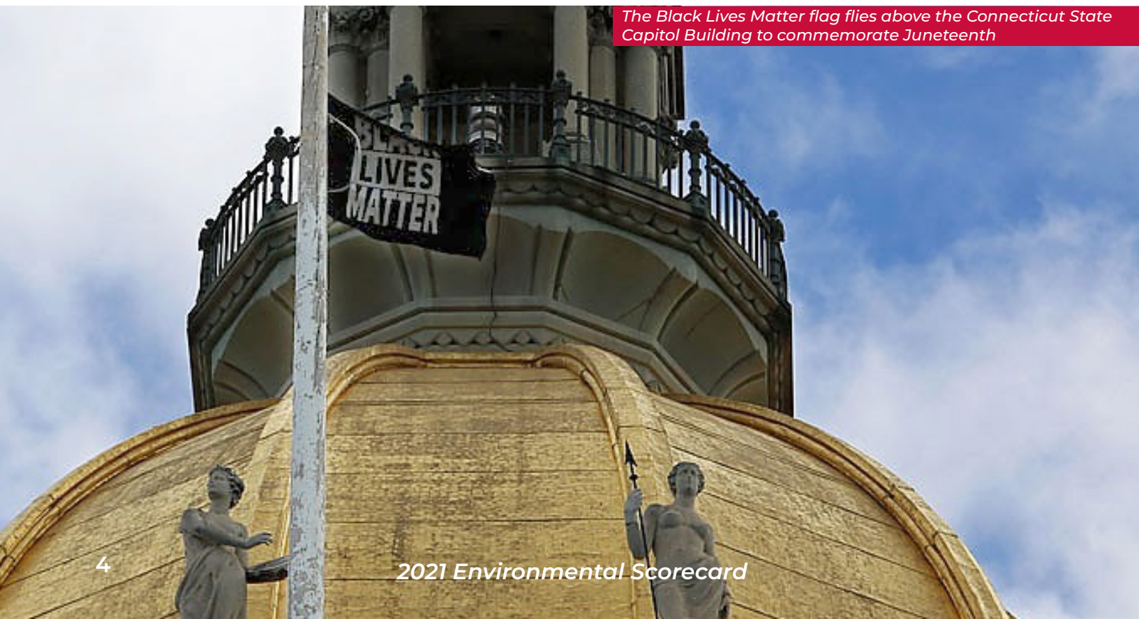
The Black Lives Matter flag flies above the Connecticut State Capitol Building to commemorate Juneteenth

Our work then shifted again to the 2020 Elections, where CTLCV's Political Action Committee endorsed pro-environment candidates and helped to elect legislative champions to the state House and Senate.