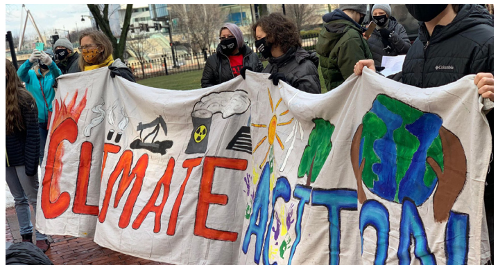
Advocates demand Climate Action now at an environmental justice rally in Hartford