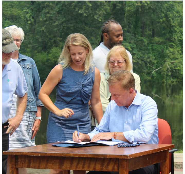
Governor Lamont signs PFAS legislation that restricts toxic "forever chemicals" from packaging and firefighting foam.

Lawmakers should untie the hands of our state's Public Utility Regulatory Authority (PURA) and provide the authority to stop permitting new fossil fuel power plants , such as Killingly.