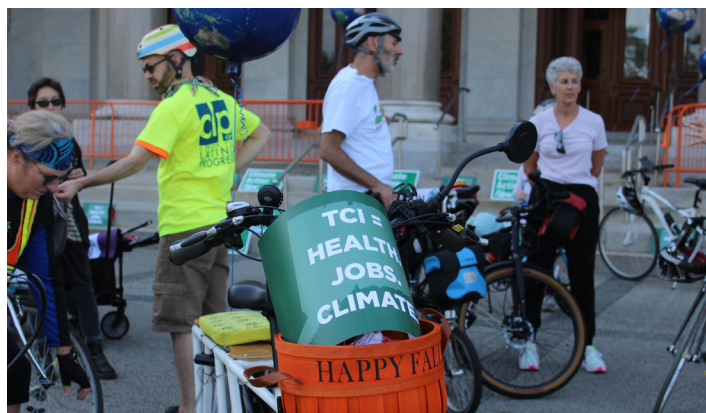
Advocates on bicycles highlight the importance of TCI for cyclists and pedestrian safety at the Bike, Walk, and Roll rally.