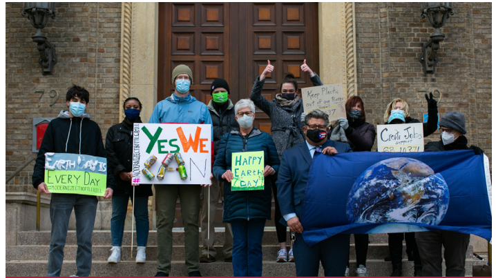
Advocates rally on Earth Day for the modernization and expansion of the of the Bottle Bill.